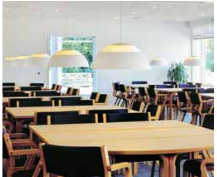
Færgedgården, Juelsminde, Denmark.