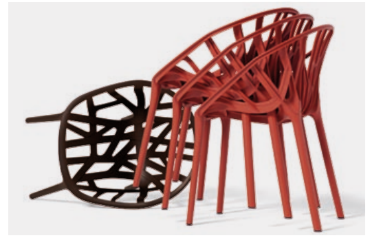
Vegetal can be stacked up to three chairs high.