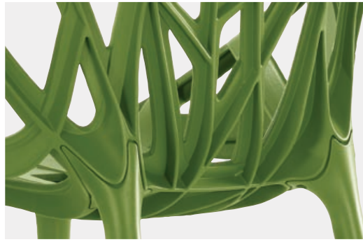
The asymmetrical design of the rear legs emphasise the chair's organic appearance.